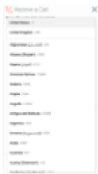
Mobile fullscreen view showing country codes for phone numbers