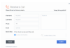
Desktop Callback view