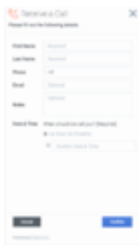
Mobile fullscreen view in portrait orientation