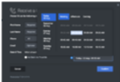
Callback with Calendar in desktop