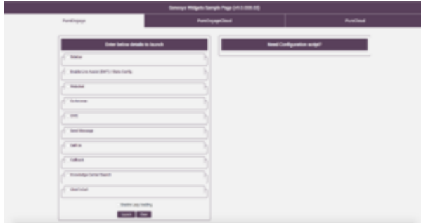
Launcher tool for Genesys Engage API (click to enlarge)

Once all the necessary configuration details are entered, click on the Launch button to launch Widgets.