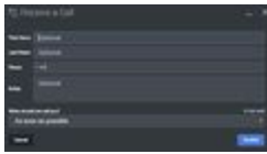
Mobile fullscreen view in landscape orientation