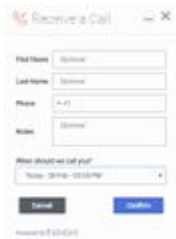
Desktop Callback view with selected date and time