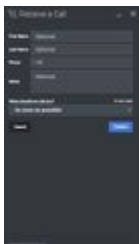
Mobile fullscreen view in portrait orientation