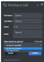
Choose Callback time in desktop