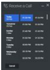
Callback with Calendar in desktop