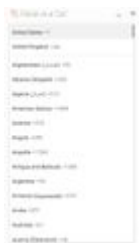
Mobile fullscreen view showing country codes for phone numbers