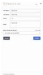
Mobile fullscreen view in portrait orientation