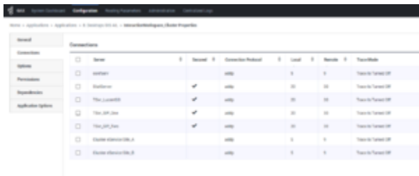
Example of Workspace in a cluster configuration for Disaster Recovery

You can define the addp parameters for all applications of the cluster from the Workspace application connections table. These parameters can be overridden in each server application.