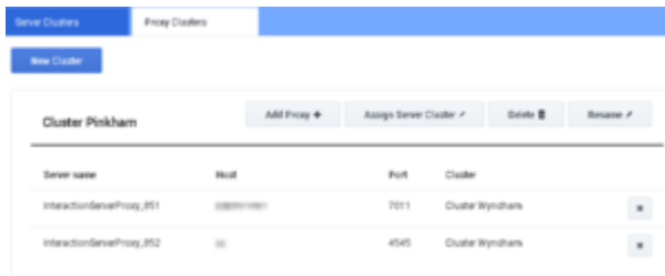
Cluster Manager: Proxy Cluster

Creating Interaction Server Proxy cluster is much the same, except that you must also use Assign Server Cluster to associate the Proxy with an Interaction Server cluster, as shown in the figure.