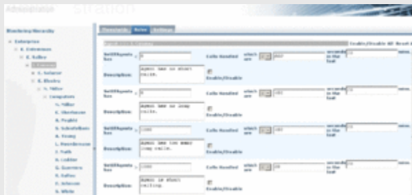
Editing a Rule

Suppose you want to override the inherited Calls Handled value of 300 with an override value of 600 for the Conway node and its subtree. To modify a rule value, first click the Edit button (not displayed in the following screenshot because it is scrolled out of view). Enter the override value and click the Save button. The following screenshot shows what the values now look like.