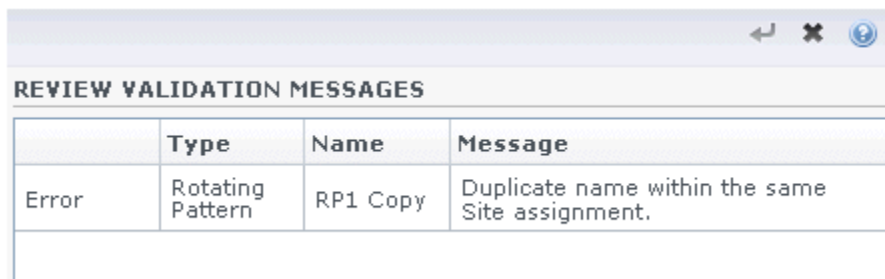
Figure: Rotating Patterns Error Message