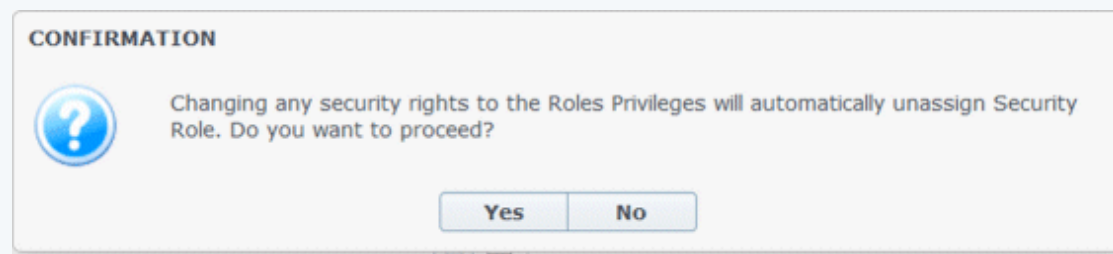
Figure: Confirmation Dialog

If the user's role privileges are changed in this module and they no longer match the privileges set in the Roles module, the following dialog appears: